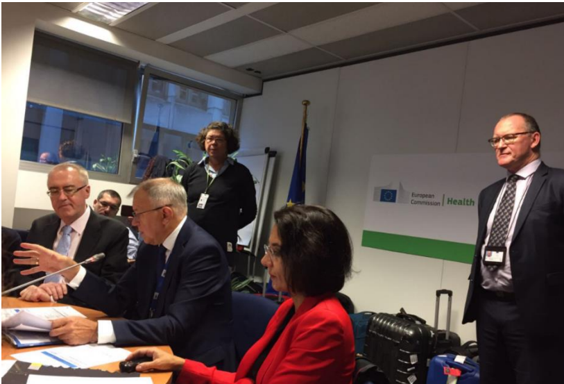
Commissioner Andriukaitis addressing all the participants