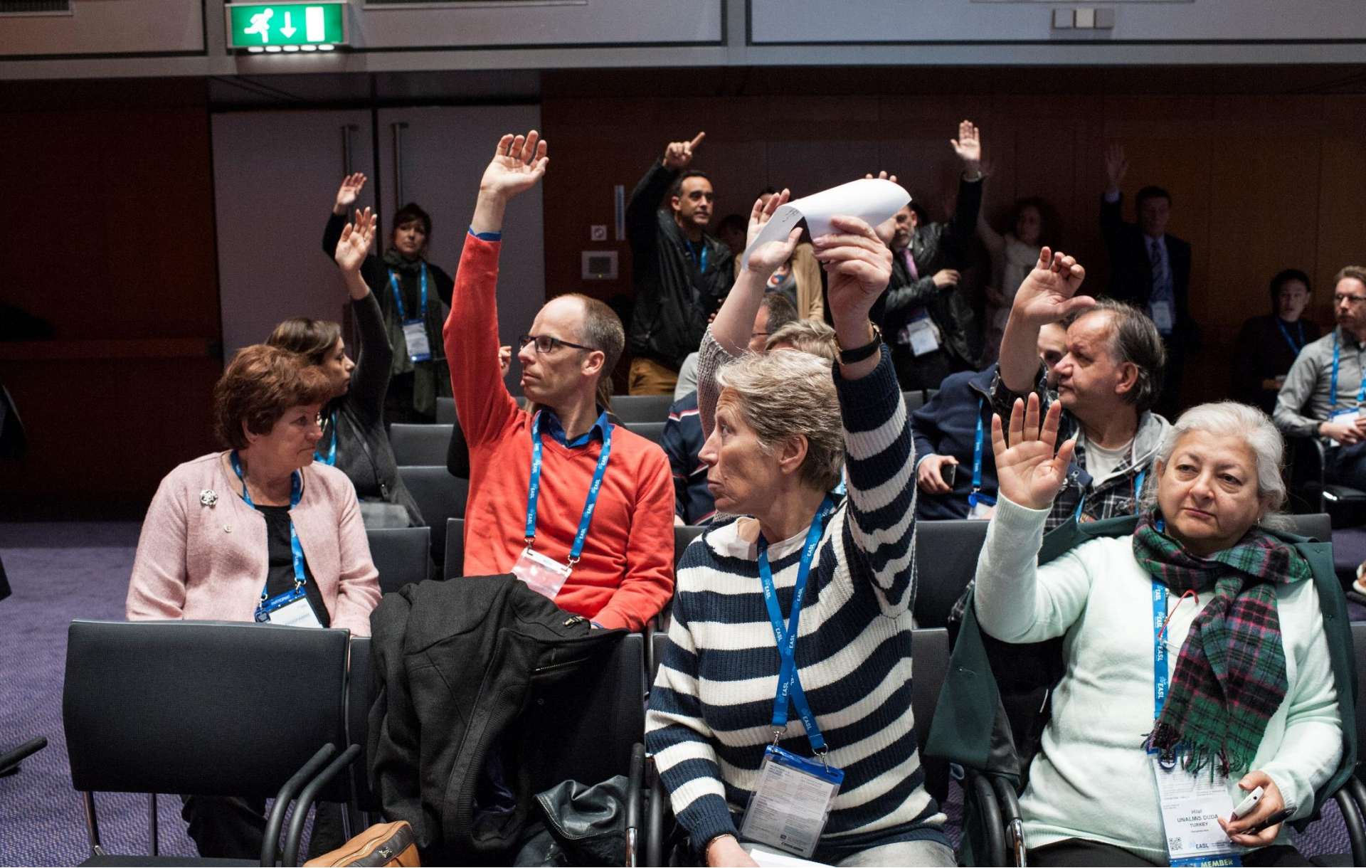
Annual General Meeting