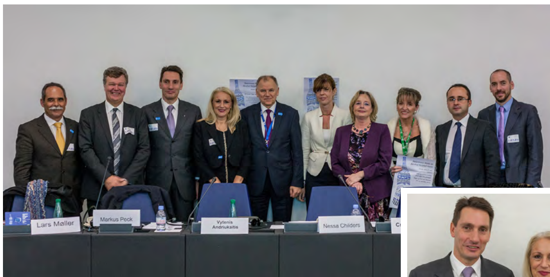
AWARH - European Parliament in Strasbourg - 2014

materials including newsletters and updates, which reached over 1200 recipients, a website ( www.awarh.eu ), social media outreach and four infographics. In addition, ELPA was responsible for organizing two events, one of which took place at the European Parliament in Strasbourg, was hosted by Cristian Busoi and Nessa Childers MEPs, and had as its highlight the participation of Commissioner for Health Vytenis Andriukaitis.