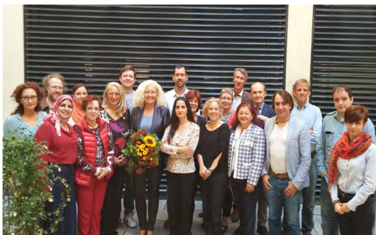
ELPA - Training in Liver Cancer - 2014

Feedback from the course showed wide satisfaction and ELPA looks forward to continuing and expanding the training course programme in the future.