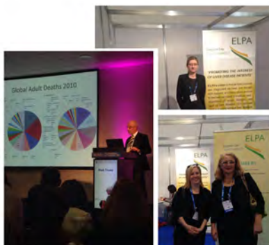
ELPA - ILCTM 2014

With the aim to develop a pathway for effective health responses and to open treatment for those who need it, this conference brought together drug user community representatives, harm reduction experts, health care professionals, pharmaceutical companies, researchers and policy makers.