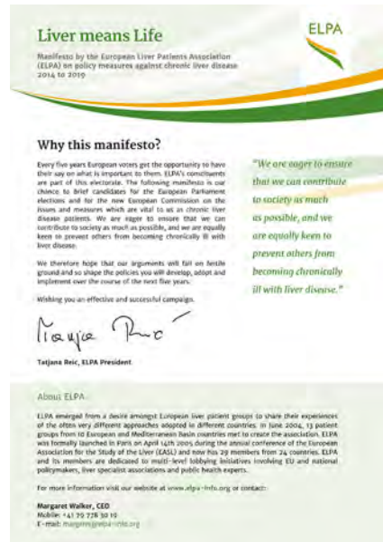
The Manifesto "Liver means Life"

The Burden of hepatitis C in Europe – the case of France and Romania is a report commissioned by ELPA which outlines the current and future burden of hepatitis C reviewing both epidemiological and economic aspects of the disease.