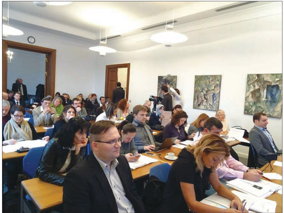
Hep-CORE launch at international press conference, Berlin