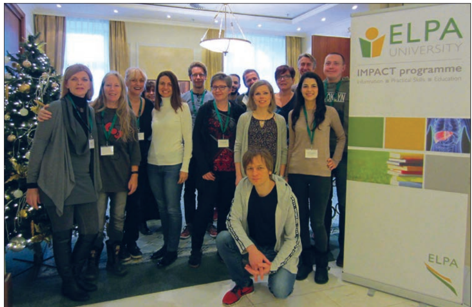
ELPA University students in Warsaw