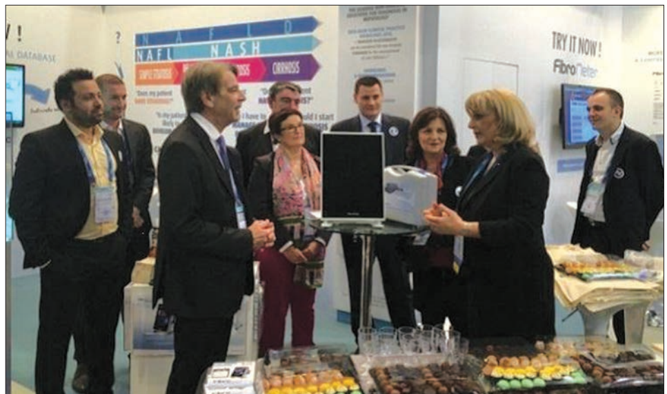
ELPA President accepting the donation in Barcelona