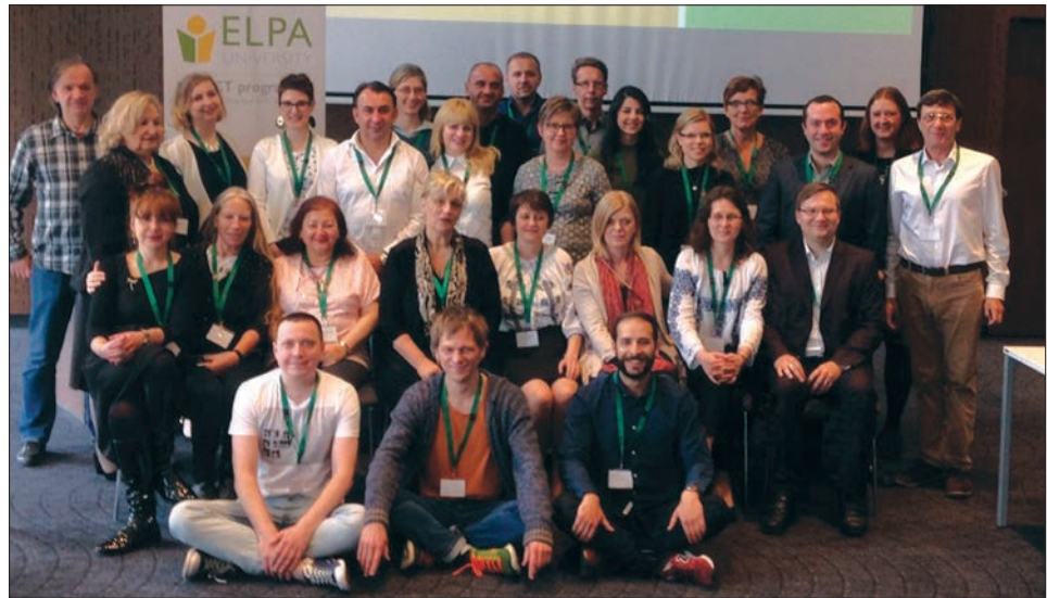
ELPA University students in Belgrade

Back in 2015, ELPA created ELPA University , a year-long capacity building programme on liver health and advocacy which combines both theoretical learning and skills based trainings. The course, designed in 3 – 4 modules, has been developed to enable ELPA members to confidently advocate for improved liver health services and care within their countries. During the 2016 we have continued with the good practice and organized new school year for 28 patient groups' representatives from 16 organisations, covering 13 countries.