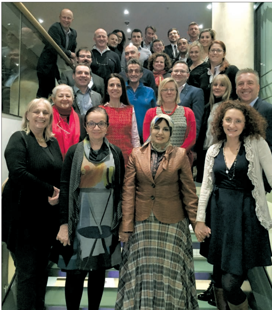
Advisory Board Meeting participants in Berlin