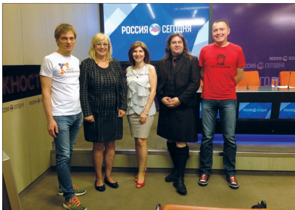
ELPA representatives with colleagues from Russia

greater discrimination. World Hepatitis day is an important tool in raising awareness of this silent disease and fighting for appropriate treatment standards for all the patients.