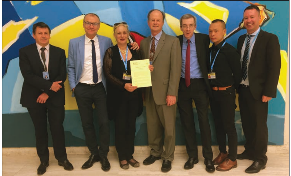
Finally we got it! - Hepatitis community representatives and WHO celebrating Global Health Sector Strategy on Viral Hepatitis at World Health Assembly