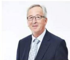
Jean-Claude Juncker, President of the European Commission