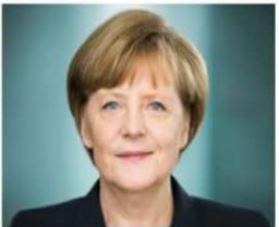
Angela Merkel, Chancellor of the Federal Republic of Germany