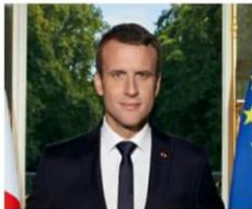
Emmanuel Macron, President of the Republic of France